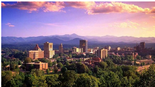
Asheville, North Carolina

The destination of the 2020 Winter Footing Academy and League Symposium.