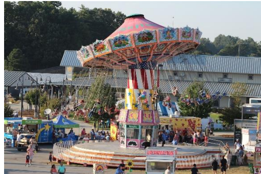
The NC Mountain State Fair celebrates the people, agriculture, art and tradition.